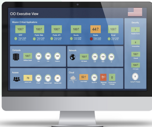
Critical Applications (Public Sector)