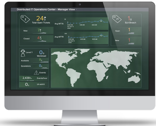
IT Operations (Corporate Systems)