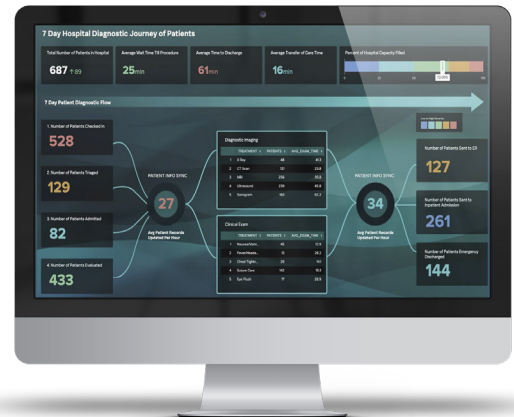
Hospital Diagnostic Flow